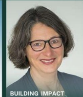
BUILDING IMPACT STEP BY STEP