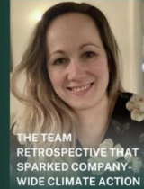
THE TEAM RETROSPECTIVE THAT SPARKED COMPANY- WIDE CLIMATE ACTION