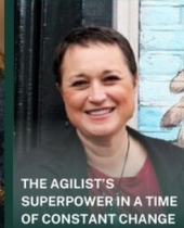
THE AGILIST'S SUPERPOWER IN A TIME OF CONSTANT CHANGE