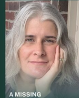
A MISSING AGILE VALUE