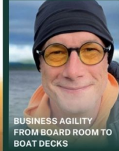
BUSINESS AGILITY FROM BOARD ROOM TO BOAT DECKS