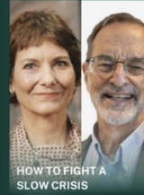
HOW TO FIGHT A SLOW CRISIS